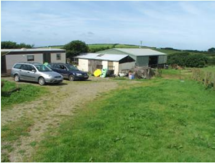
Arrival Yard & Buildings